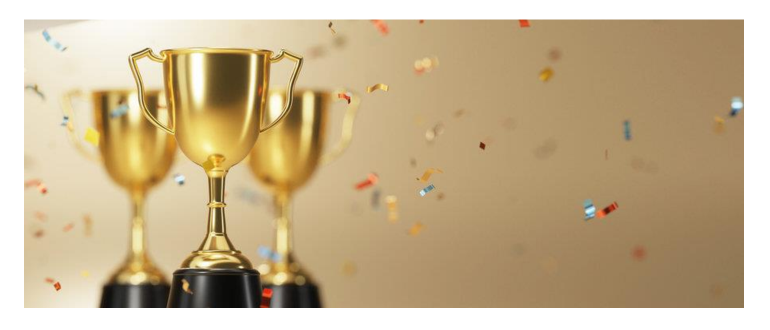
Awards Ceremony - at Conference November 17!