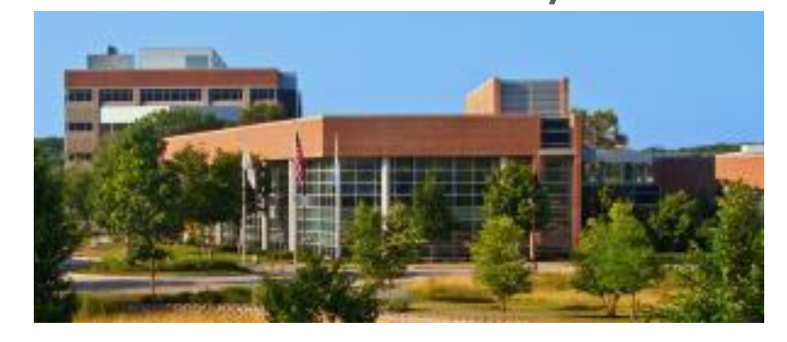
University of Illinois at Chicago